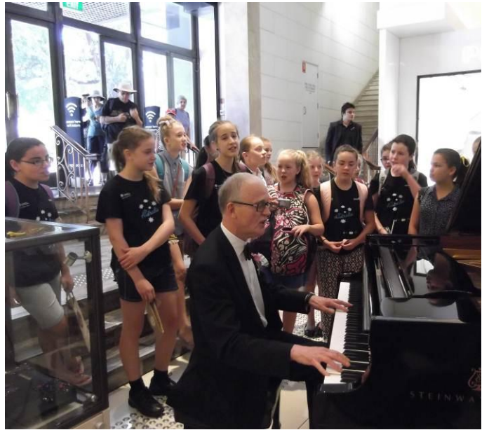
Impromptu Christmas Carolling at David Jones