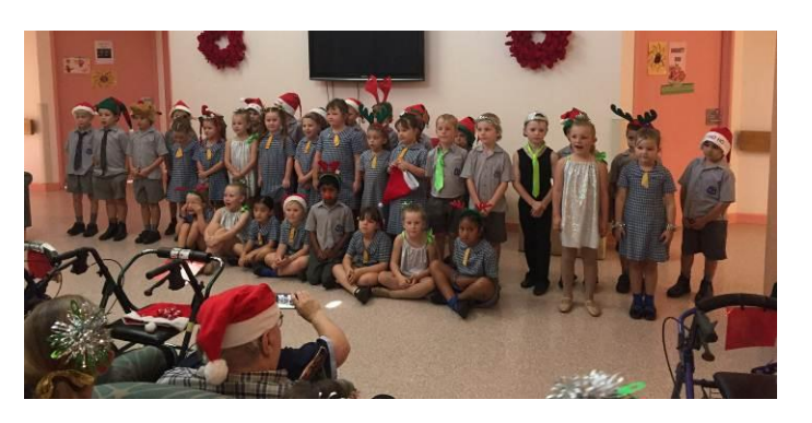
Carols in the Park